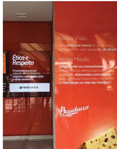
THE COMPANY'S MISSION AND VISION.

Pandurata Alimentos Ltda. (Bauducco) has a tradition of giving back to the community. The company mission is “to create moments of happiness for families,” and family supports inform its corporate social responsibility program. Pandurata Alimentos Ltda. (Bauducco) has an extensive corporate donations program and supports many organizations by donating baked goods that organizations can sell to raise funds. Although the company draws on the story of the founding family in its marketing and external representations, so far it has not explored integrating its family-friendly employee policies or its other charitable activities into its marketing strategies. This may change in the near future as Pandurata Alimentos Ltda. (Bauducco) is recasting its corporate social responsibilities portfolio and seeking a more active and integrating marketing strategy.