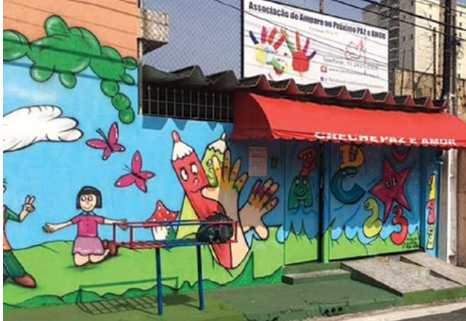
THE AMOR Y PAZ PRESCHOOL AND DAYCARE CENTER HAS PROVIDED CHILDCARE FOR PANDURATA ALIMENTOS LTDA. (BAUDUCCO) EMPLOYEES SINCE 1989.