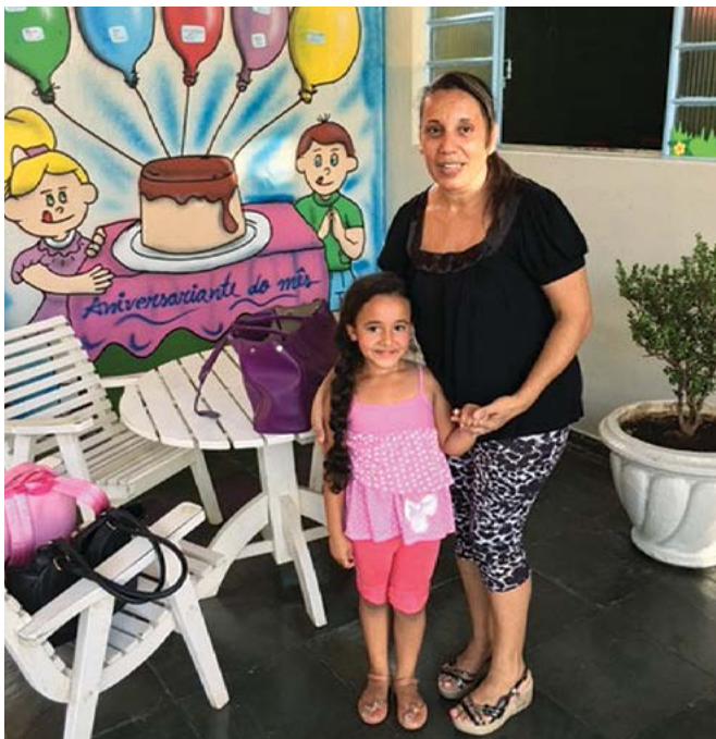
CHILDCARE SUPPORT PROVIDED BY PANDURATA ALIMENTOS LTDA. (BAUDUCCO).

In September 2016, 12 children of employees were enrolled in the center, which has a capacity of 100. This represents 28 percent of the women and children who in principle are eligible to use the benefit. The highest level of enrollment at any point in time was 20 children of employees. To date, parents have always been able to get a space for their children if they request one. Several women interviewed had placed more than one of their children in the crèche over the years. Not all new mothers use the crèche, or use it straight away.