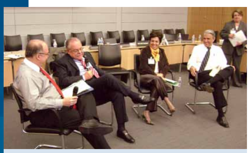
Role-play exercise during IFC-facilitated ADR pilot for IBGC, May 2010.

IBGC ran its first full ADR program in Porto Alegre, in the state of Rio Grande do Sul, a region where there are many highly successful small and medium nonlisted family businesses, typically started by Italian and German immigrants more than 100 years ago. IBGC charged a fee, attracting 14 participants who had graduated from