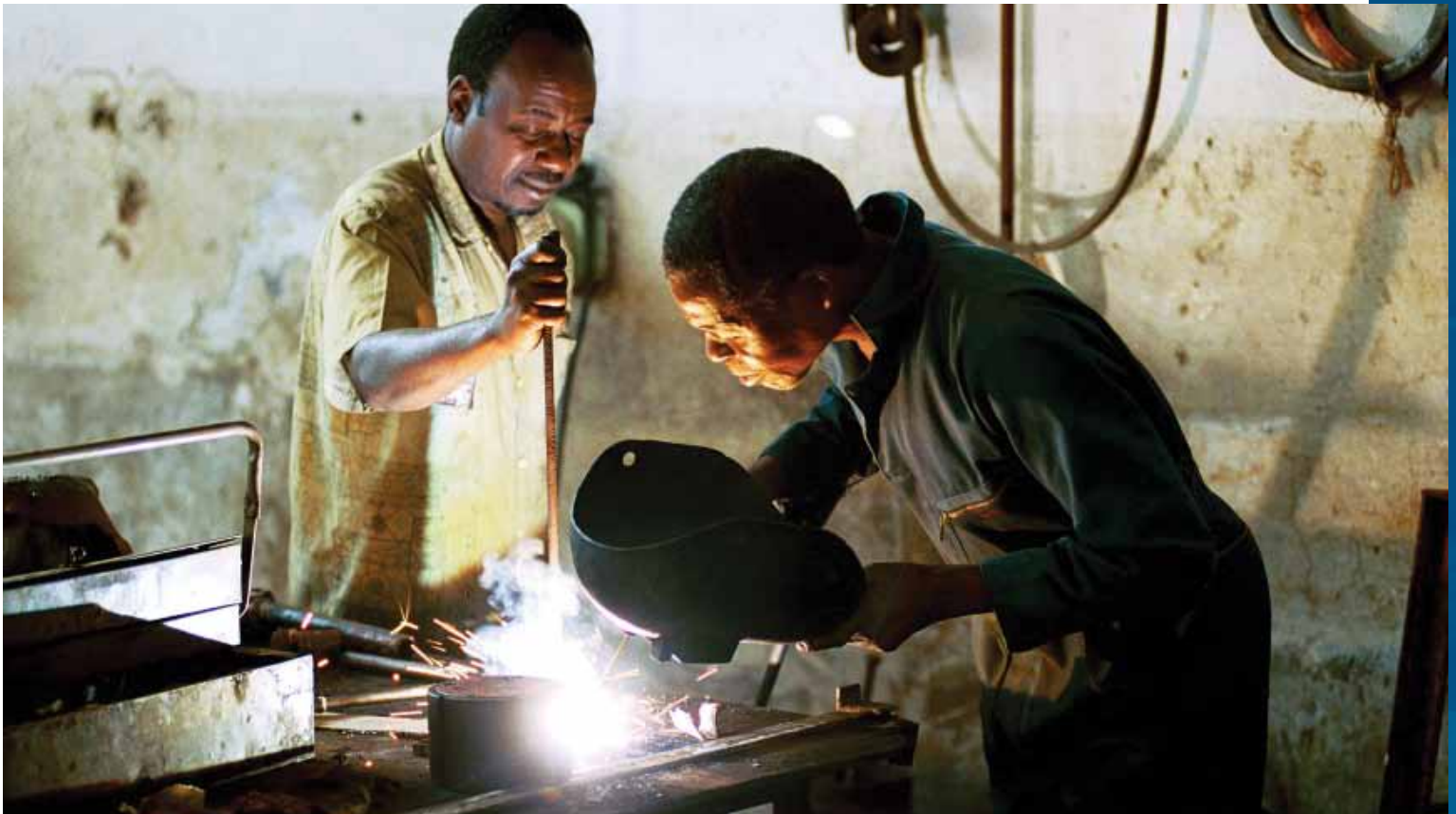
SMEs are the backbone of the Mozambique's economy.

IFC's Corporate Governance Progression Matrix and other tools are available at http://goo.gl/xdqjQ