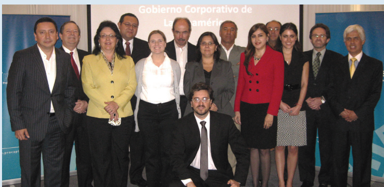
The Network Meeting, Lima. (2012)

Available at: http://tinyurl.com/l3qpew7