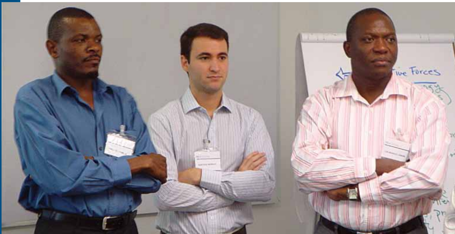
Mozambicans and Brazilians working together during a training session in Brazil. (2009)