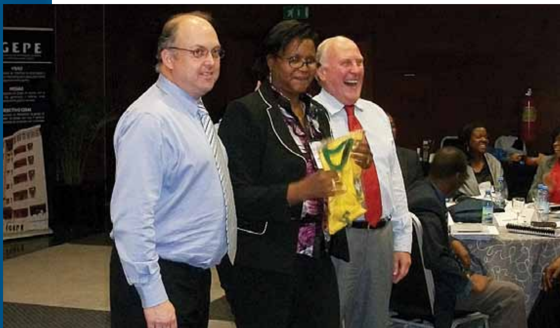
IBGC trainers give a Brazilian soccer t-shirt to a participant as a recognition for her hard work at the training held in Maputo. (2010)