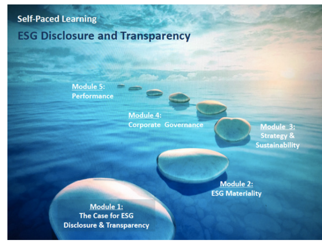
IFC's D&T E-Learning Modules

To maximize results, a cohesive and engaging experiential learning process is as important as the selection of the content that is presented.