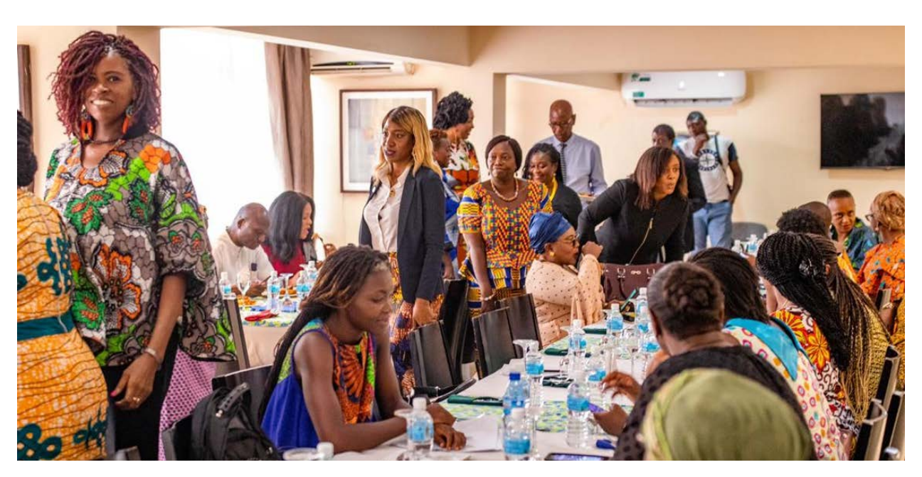
Members of Sierra Leone Women on Boards gather for their annual Women's Day Luncheon.

This turning to others, and seeking and supporting collaboration is a primary feature of women's leadership—drawing on social networks of influence, and emphasizing fluidity, inclusiveness, and mutuality. It's also a powerful example of what happens when strong, energized, confident, and capable women collectively identify a problem and work to solve it.